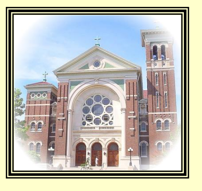
"The Lord Be With You."