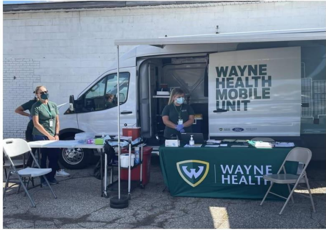
Wayne Mobile Health Vehicle with Staff Assisting Public

Detroit—The Detroit Public Library is partnering with Wayne Health (Wayne State University) to provide health and vaccine services to the community. The Wayne Health Mobile Unit will be visiting three Detroit Public Library Branches beginning in November—there is no appointment necessary and no ID or insurance will be required.