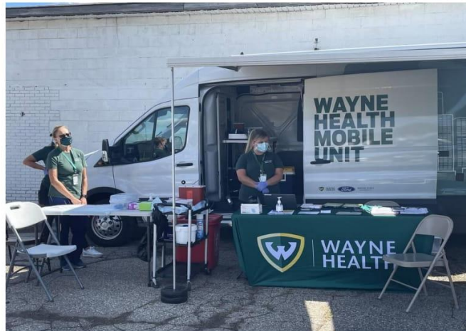
Wayne Mobile Health Vehicle with Staff Assisting Public

Detroit—The Detroit Public Library is partnering with Wayne Health (Wayne State University) to provide health and vaccine services to the community. The Wayne Health Mobile Unit will be visiting three Detroit Public Library Branches beginning in November—there is no appointment necessary and no ID or insurance will be required.