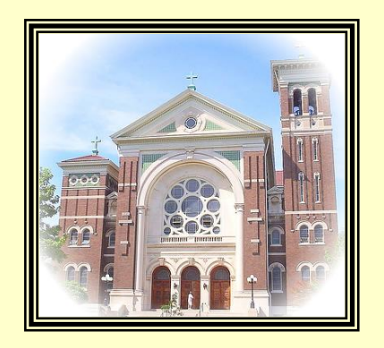
"The Lord Be With You."