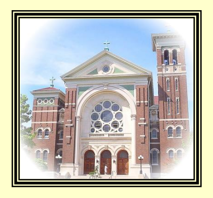
"The Lord Be With You."