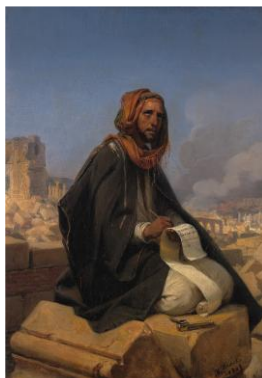
Jeremiah on the ruins of Jerusalem