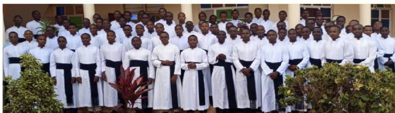
All of the seminarians of the Apostolic Life Community of Priests in Tanzania

Mission Appeal: As a young Missionary Community, they have many needs. At present, they are facing the challenge of meeting the tuition fees for 77 major seminarians who are studying Philosophy and Theology at Jordan University in Morogoro, Tanzania. Any assistance they can get from this Mission Appeal will help support the formation of these young men who will soon move into the priesthood. Those who will directly benefit can't thank you enough for your consideration in this. Your generous financial and spiritual help will make the difference. Please be generous in your response to Father's appeal.