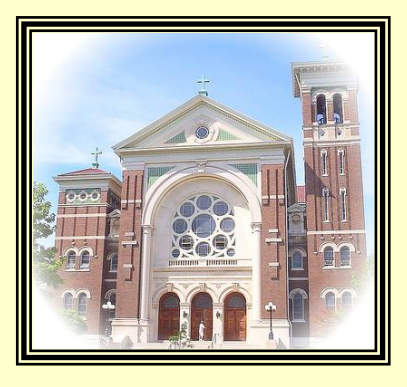
"The Lord Be With You."