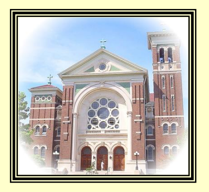
"The Lord Be With You."